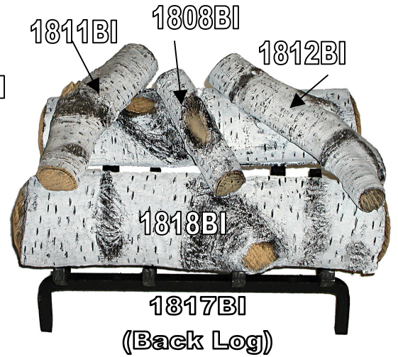
MAS1805AA 18" Set