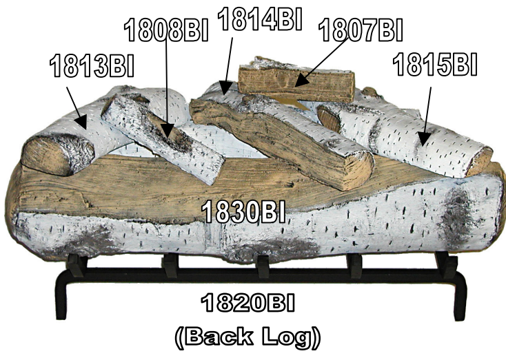
MAS3007AA 30" Set